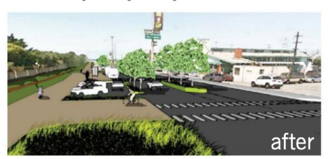
Figure V-4b: Proposed Sloat Blvd = Bike Lane + Pedestrian Walk + Diagonal Parking Pockets + 2 Driving Lanes + Planted Median + 2 Driving Lanes