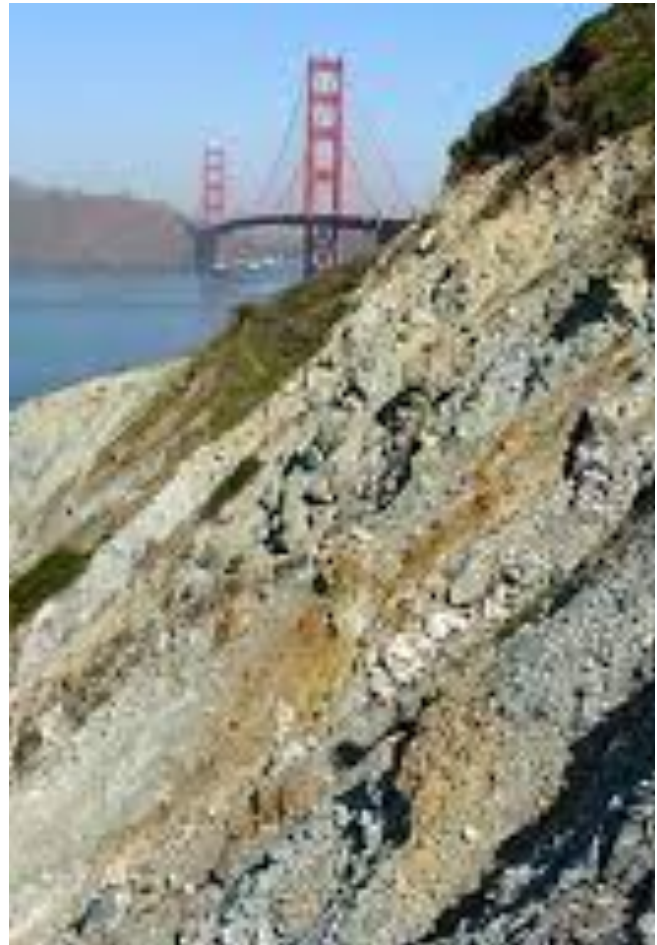
Picture of Serpentine above. For many years nuclear waste generated by the Navy at Hunters Point, was stored in 47,000 steel 55-gallon barrels. The buildings where these radioactive barrels were stored also became radioactive.

VOC compounds (volatile organic compounds) are also present, which can enter the sewer and drainage pipes damaged by seawater-rise and can enter low and high-rise residential and commercial buildings, forming toxic gases, that add to the toxicity of the site.