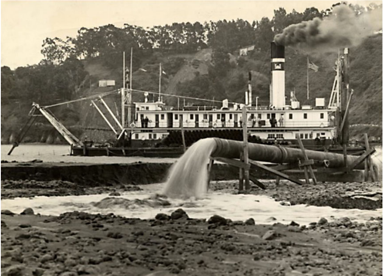
The creation of Treasure Island in 1936 for the Golden Gate International Exposition—fill to create the island was made of wet sand.