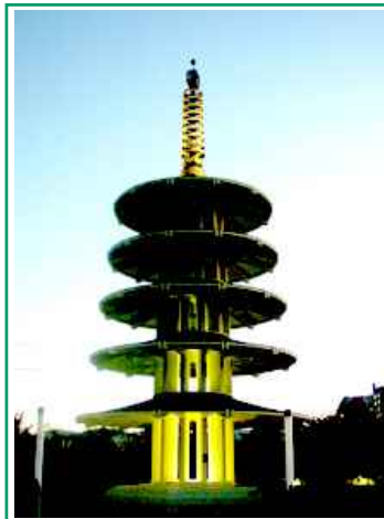
Japantown's Peace Pagoda