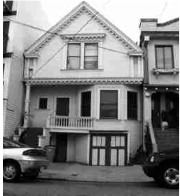
The first action of our new Prop D "neighborhood friendly" Planning Commission