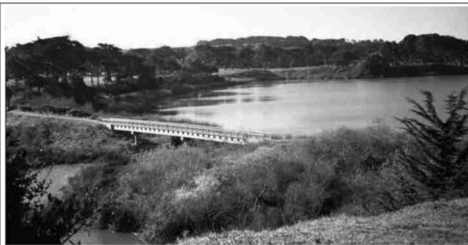
Neighborhood and environmental activists efforts are paying off, as Lake Merced rebounds

Vigilance by community organizations is greatly needed. The resolution recently introduced to the Coalition of San Francisco Neighborhoods by the Golden Gate Heights Neighborhood Association calling for intensive community review of the city's recycled water program is just one more important step in the right direction. Involving neighborhood organizations along with the Lake Merced Task Force Water Committee will very helpful to the administrators of the $103 million recycled water project and beneficial to San Francisco. We urge all CSFN members to support